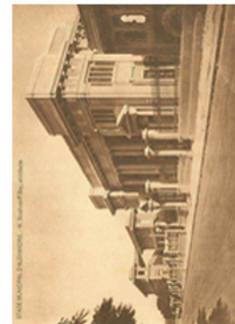
Alexandria Stadium picture dedicated to Russian Architect Nichosov 1929.