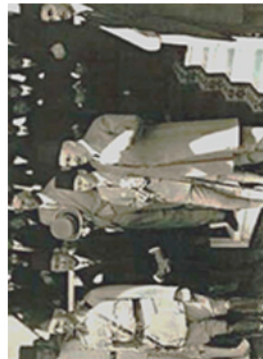
King Fouad I and Prince Farouk attending the inauguration of the Stadium 1929