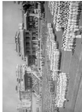
Victory Thanksgiving of Royal Chaplainry Service at Alexandria Municipality 1945.