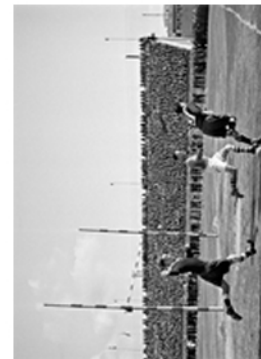
Player touch down at NZEF VS Rest of Egypt rugby match at Alexandria Stadium 1943 .