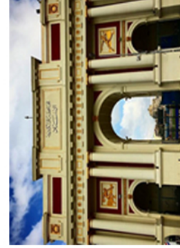
The Marathon Gate 2018 after renovations .